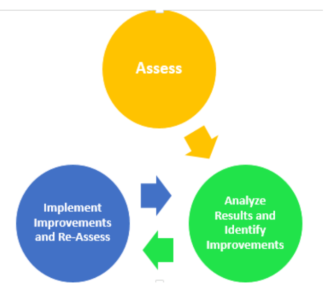
Figure 1: Assessment Cycle

An assessment cycle is displayed in Figure 1 . A cycle is completed when a general education competency (student learning outcome) has been re-assessed. Re-assessment allows the College to determine if improvements that were made have impacted students learning.<sup>1</sup>